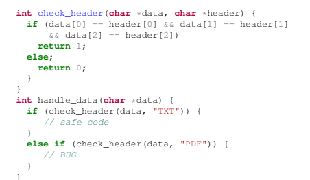
Listing 1: In this example, a utility function, check_header is used for multiple checks. An abstraction function that only tries to cover all edges will likely fail to pass both checks, because it will have already seen the edges within the utility function.

The intuition behind this abstraction is that if there is some function that performs a comparison, such as a stremp, it is useful to satisfy that comparison when it is called in different contexts and not in a single context. For example, in Listing 1 a single function is used to check a three-byte header. A Basic Blocks or Edges abstraction can satisfy the check once because, as each successive byte is matched, the new input will be considered interesting. However, it will only match one header, because for a second header those blocks/edges will have already been seen in the utility function, and it would not be able to successively match the new bytes. On the other hand, the Edge + Return Loc abstraction will match the header multiple times, because it includes the calling context .